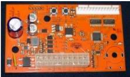
V7.2 – U.S. 110v tables without sound part # 880400127

DO YOU REPAIR FAILED AIR HOCKEY BOARDS? We do not. Many tables starting with the v2.4 board can be upgraded to the current v7.2 PCB, and that way you get the most current part with all the latest features and no “Repair history.” YOU CAN PURCHASE THE v7.2 PCB INTERFACE KIT AT THIS LINK. This includes the board and the adapter to install it in an older table. Valley-Dynamo Tech Support will be able to help with the specifics. Current PCBs look like (color may vary, and scale might be a little off):