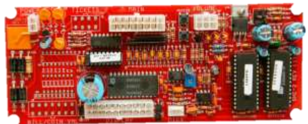
V9.0 – U.S. 110v tables with sound part # 880400140