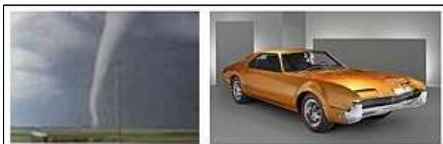
It's "TORNADO", NOT "TORONADO"

The name of any product from Oldsmobile had nothing to do with it – incidentally, "Toronado" (note the extra "o") is a made-up cool-sounding word with no prior meaning originally used by GM for a 1963 Chevrolet show car. There is no "Toronado is the Spanish word for..." They made up "Camaro" too.